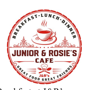
Breakfast at J&R's continues to be a popular club event. The prices are right, the food is good, and the ham radio fellowship is great! The group meets between 7 and 7:30 am for food and fun