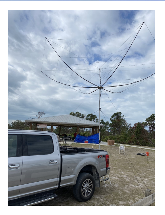
5 band hex beam on N4LJT truck bumper mount and push up pole