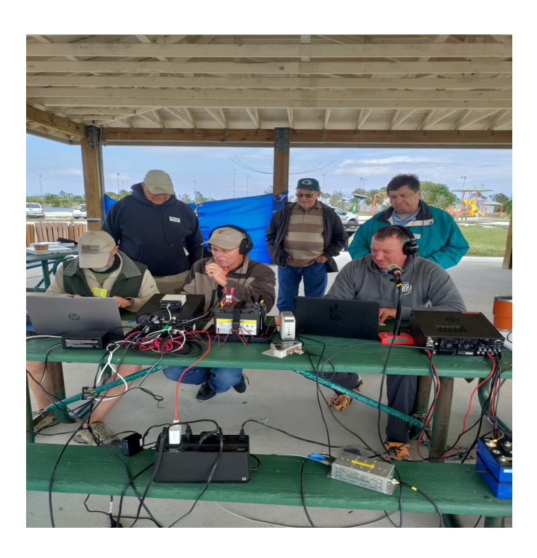
KW4SAB and W1JP piling up contacts!