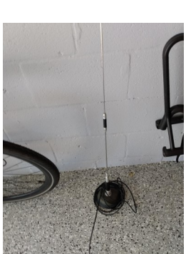
A Comet mag mount VHF/ UHF