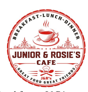
Breakfast at J&R's continues to be a popular club event. The prices are right, the food is good, and the ham radio fellowship is great! The group meets between 7 and 7:30 am for food and fun. This summer we average about 8 club

Fun and fellowship at Junior and Rosie's and t