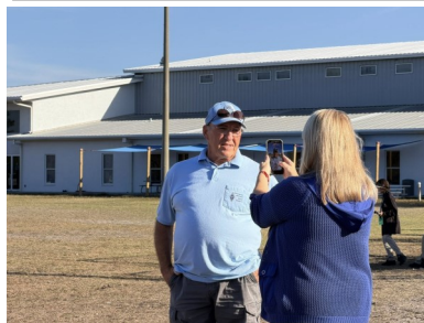
K7WWR media interview

tracking the balloon using SondeHub Amateur, an online site designed to monitor and report on balloons using APRS.